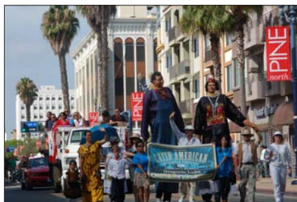
Latin American Parade