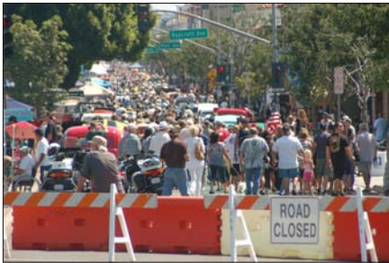
Belmont Shore Car Show

The 100 th Anniversary Celebration of the Port of Long Beach this summer drew a crowd of 5,000 to see 70 interactive displays.